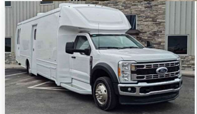
37FT TWO ROOM WITH LAB MOBILE MEDICAL CLINIC WHEELCHAIR LIFT