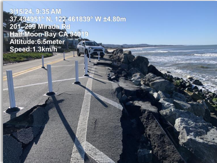
Photo examples of failed western edge of pavement (failed areas range in length and width).