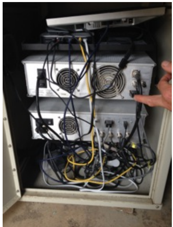
Clockwise from top: Receive antenna, transmit antenna, sea-air corrosion on Rx antenna, electronics.