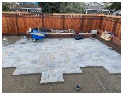
The new pavers being installed in the backyard.

appreciate every single gift since each one enhances and