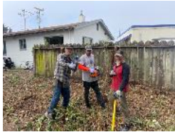
The old fence comes down

We even hosted two days of Covid vaccinations for the homeless community.