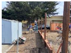
The new fence goes up, thanks to the Rotary Club!

We are busy! Thanks to all of you and your generous support, each program is