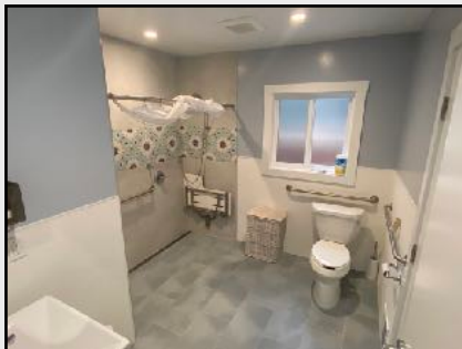
These three photos were all taken from the same position and show the evolution of the accessible bathroom.

own program now, and we offer special services and supports through the new center.