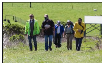
The crew hiking up to their work site

District, This new year was the perfect time to launch our latest program initiative: the Conservation Crew . Now, program participants can move beyond the agricultural fields and engage in important environmental work, while improving their teamwork skills and collaborating to complete a successful project.