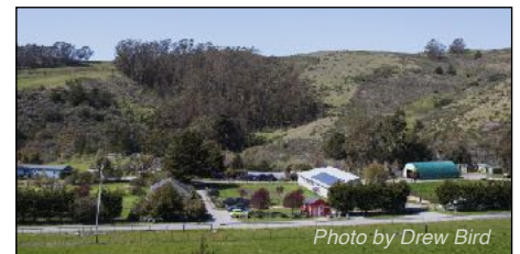
The view of Potrero Nuevo Farm from the conservation crew site.

As the farm managers of Potrero Nuevo Farm, we've been helping run Abundant Grace's programs for close to a decade. We are always looking for new opportunities to provide for our neighbors experiencing homelessness. For years, we contemplated the idea of venturing into the wilderness areas of the 300-acre farm. Farm owners Christine Pielenz and Bill Laven have stewarded the land with sustainable practices, and with our new Carbon Farm Plan from the Resource Conservation